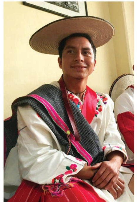
Visiting with MEF scholars at Sna Jtz'ibajom in San Cristóbal, Chiapas in March