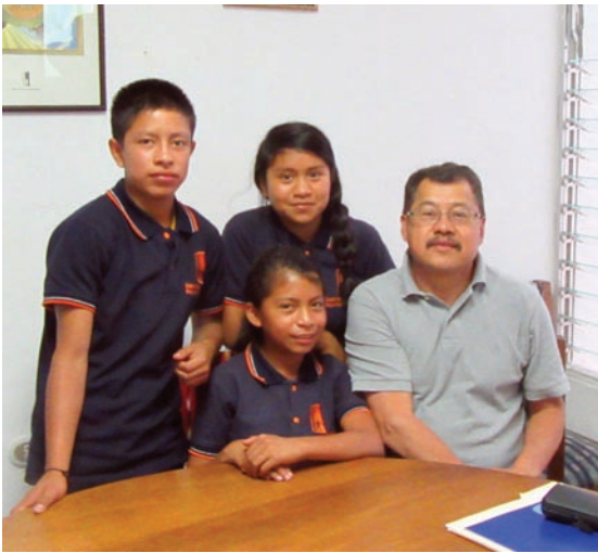
MEF President visiting with Esperanza Juvenil in Guatemala City, April 2017