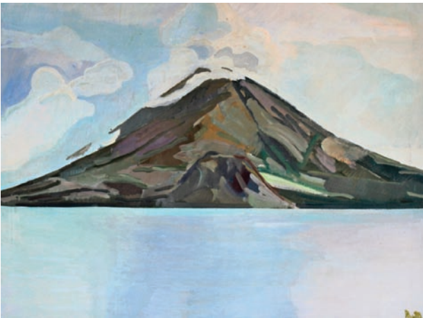
San Pedro volcano, Atitlan, 30×40 in. 1973