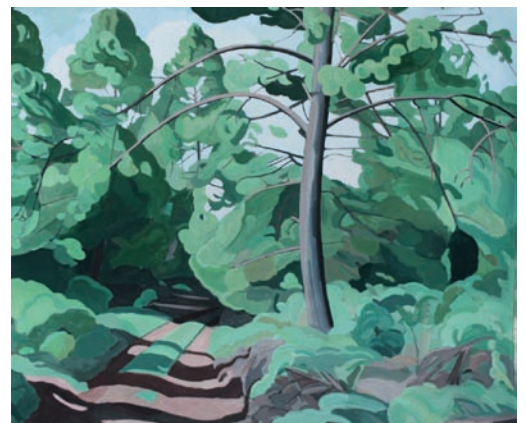
Chiapas woodlands, Tenejapa Road, 40×48 in. 1976